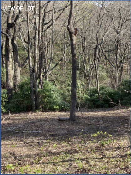
VIEW OF LOT